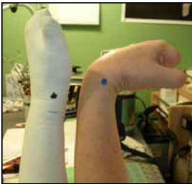
Mark left side

Follow the kit casting instructions with these modifications: